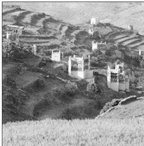
Terraces and dovecotes at Tinos, in Greece.