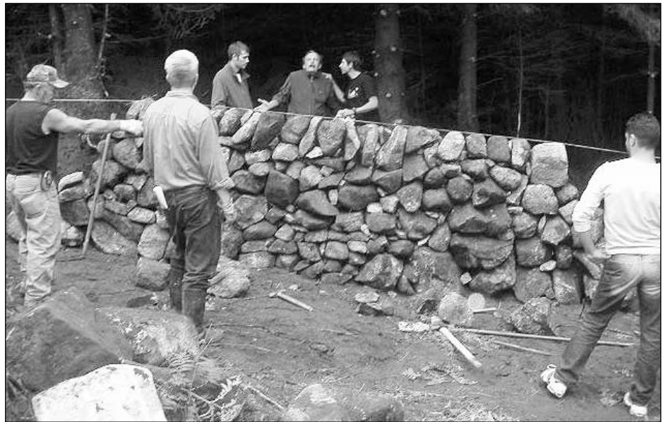
Scotland, Dalbeattie Granite Festival.